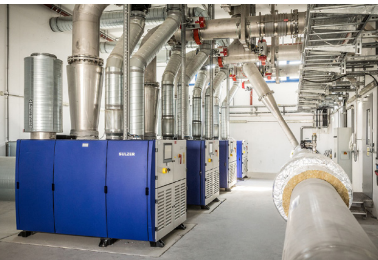
Sulzer's HST turbocompressors reduced total power consumption by 400 kW

Vienna's old wastewater treatment plant consumed around 60 GWh of electricity every year, more than 1% of the city's largest energy producer. With the E_OS project, the city's water utility ebswien wanted to turn biogas production using sewage sludge from a "nice to have" into the core of a truly sustainable, self-powering facility. At the center of the upgraded plant are six 30-meter high digesters, each capable of generating biogas from 12'500 cubic meters of sludge. Beyond boosting the plant's energy output, the project's engineers also wanted to ensure that processes across the site were designed with maximum energy efficiency in mind. It was the search for efficient, reliable solutions that brought the team to Sulzer. With decades of experience in water and wastewater treatment applications, Sulzer specialists were able to suggest a number of smart solutions that helped ebswien reduce its energy consumption and improve equipment across the site. The first of those solutions was the mixer units for the digester tanks. These giant mixers continually stir the sludge in the tanks to keep the anaerobic digestion process running optimally. Sulzer's proposal involved the use of a large, 4.5 meter diameter Scaba vertical agitator, rotating at a low speed of only 8 rpm. With that configuration, the Scabas would only require small 11 kW motors.