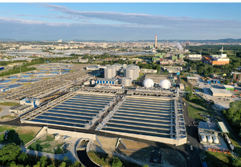
The E_OS project has made the wastewater treatment plant a net producer of energy

The E_OS (Energy Optimization through Sludge Treatment) project on the edge of Vienna is a pioneering facility designed to transform the Austrian capital's wastewater treatment plant from a major energy consumer into a net producer. Important parts of the project therefore include maximizing energy efficiency and optimizing power generation, both of which were supported by Sulzer's expertise.