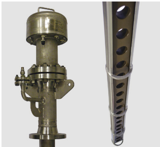
Spool piece, instrument housing and measurement rod

Sulzer Chemtech NO, Solbråveien 20, 1383 Asker, Norway Phone: +47 67 55 47 10, upstream.systems@sulzer.com